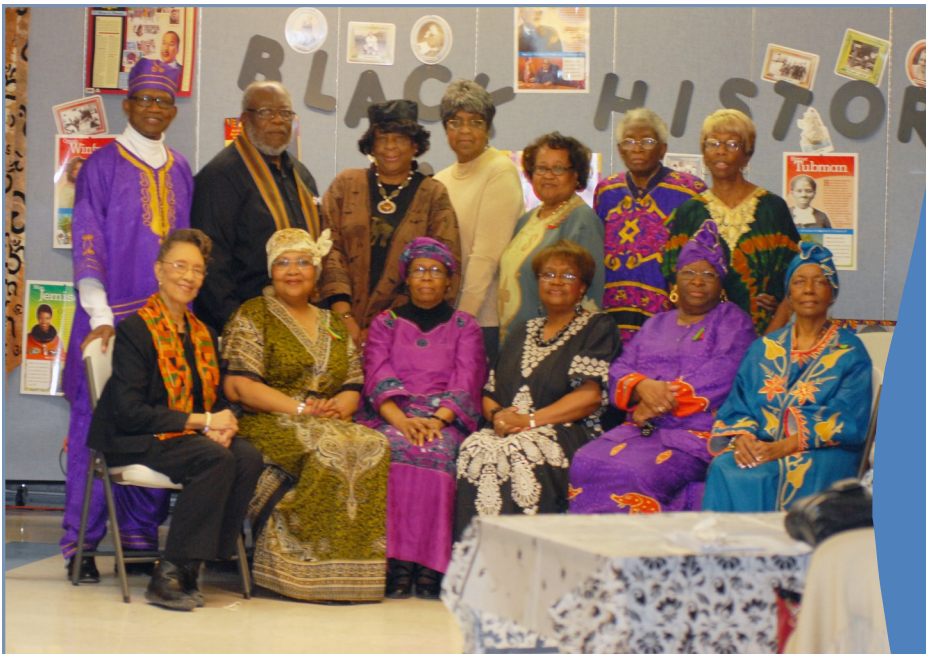
Platinum Plus Senior Adult Ministry Council of Elders

Are you a senior adult with a birthday not listed? Call or email the church office.